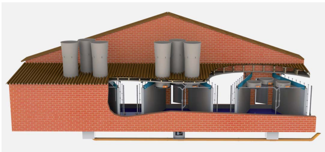
Fig. 2: Diagram of MagixX-B exhaust air scrubber

Summary 1: MagixX-B exhaust air cleaning system from Big Dutchman